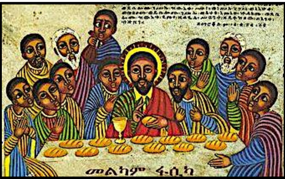
Coptic Orthodox Icon, The Mystical Supper